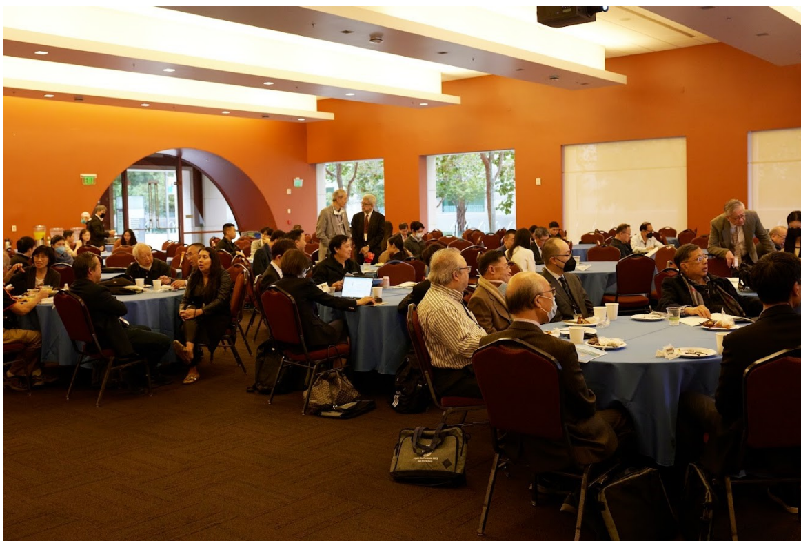
Conference during a break