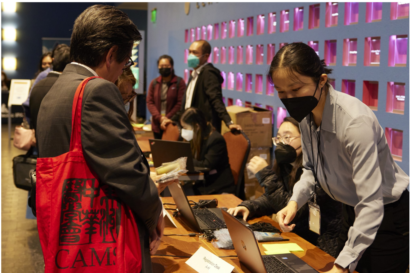
Registrant check in for the Conference

Save November 4, 2024—our next Biennial Conference in New York City and 40th Anniversary of the FCMS!