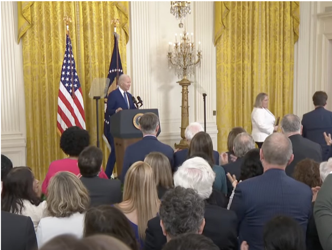
White House Event on March 23, 2023 with President Biden

https://www.whitehouse.gov/briefing-room/speeches-remarks/2023/03/23/remarks-by-president-biden-at-an-affordable-care-act-anniversary-event/